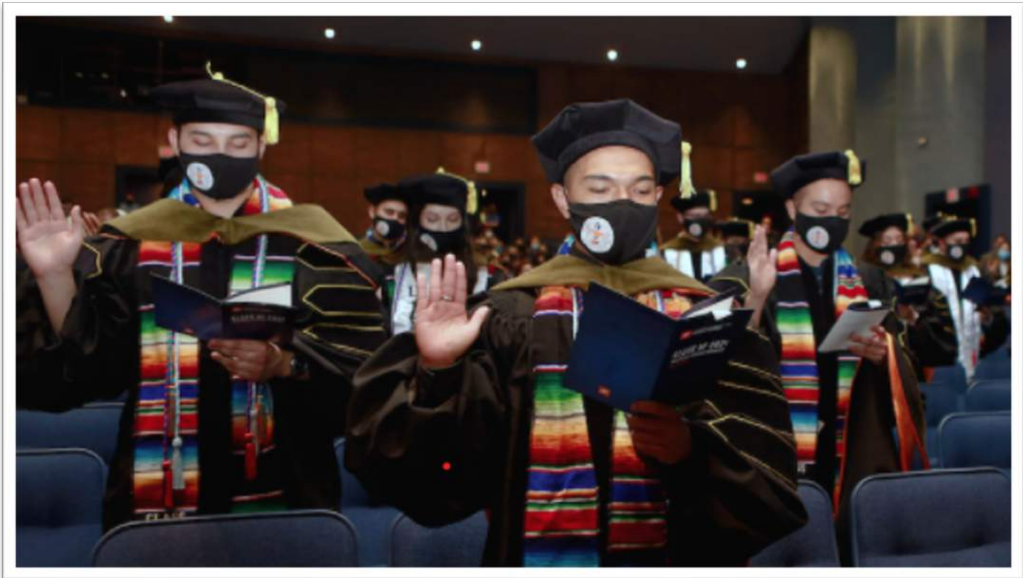
Students in UTEP's first graduating class from the School of Pharmacy took the oath of a pharmacist during the Pharmacy hooding ceremony May 13, 2021. UTEP awarded its Inaugural Doctor of Pharmacy (Pharm.D.) degree to 40 graduates at the University's spring 2021 Commencement ceremony Saturday, May 15, at Sun Bowl Stadium.